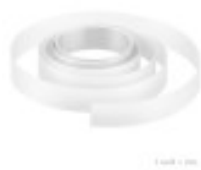
1 roll = 1 roll